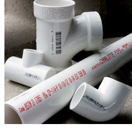
Laser code (color change)